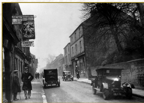
Bridge Street, Belper, circa 1940. The Devonshire is part way down the street on the right.